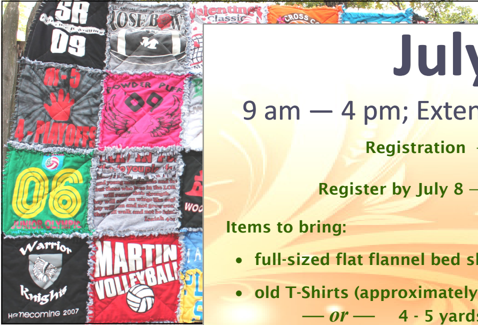
Materials will make a Travel-Sized Quilt.