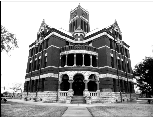
Abbie Horne — Elements & Design 2nd Place, District Roundup

Abbie Horne Elements of Design ----- 2nd Place Nature & Landscape ----- 4th Place