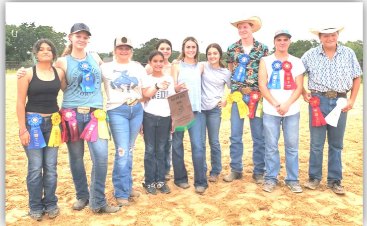
Congratulations to the Riders, Drill Masters, Club Manager, Parents and families of Lee County Texas Stars 4-H Club. Well Done !!