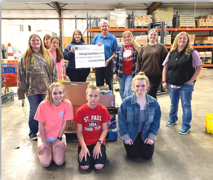
Lee County 4-H Clubs have donated food to the Giddings Food Pantry for several years.

** Information forthcoming. Watch your 4-H NEWS emails for details.