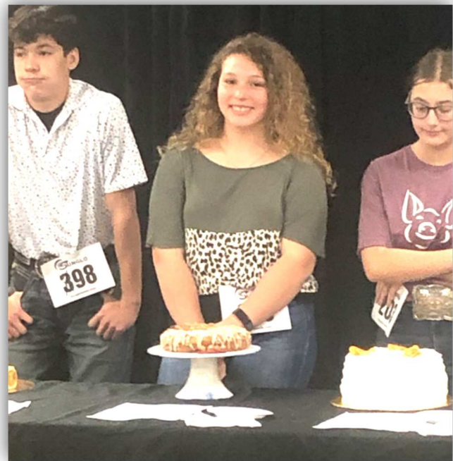
Cake Exhibitors at the LCJLS await the Judge's decision.