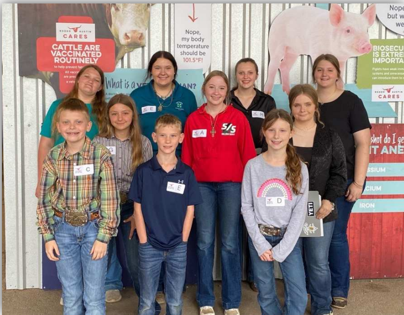
Livestock Judging competitors at 2023 Rodeo Austin.