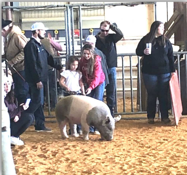
Younger siblings can join in during the LCJLS Show on Saturday morning for Pee Wee Showmanship. Qualified exhibitors accompany each youth as they receive instruction on the use of a show stick in guiding the swine through the arena.